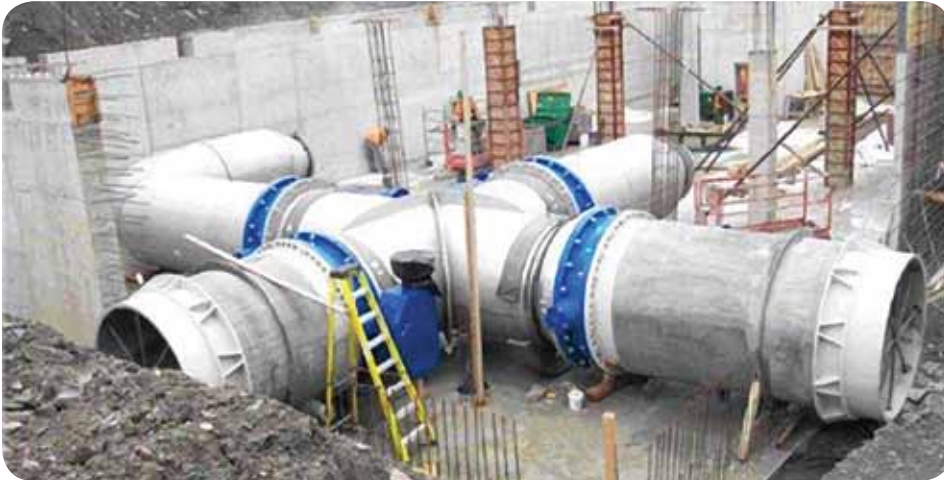
NSF 61 Certified Stainless Steel Pipe and Fittings from Douglas Barwick Inc.

A COMMON MISUNDERSTANDING is that if a grade of stainless steel appears in Annex C of NSF/ANSI Standard 61 (NSF 61), any product manufactured solely from that alloy may be represented as certified to NSF 61. However, manufacturers of stainless steel products wishing to offer those products as certified to NSF 61 and bearing the NSF Mark must obtain certification of the specific product from NSF.